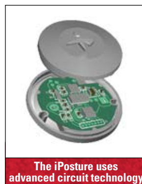
The iPosture uses advanced circuit technology