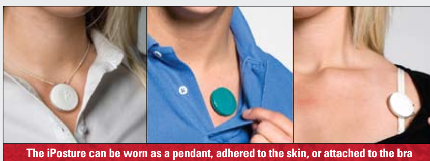
The iPosture can be worn as a pendant, adhered to the skin, or attached to the bra

One single button controls all the iPosture functions, and operating the device is simple: put on the device, stand erect, hold a good, comfortable posture, and briefly press the central button. The iPosture vibrates once, acknowledging that proper posture has been set. It can adapt to each person's unique body type. The iPosture can be reset at any time to allow the user to fine tune their best personal stance. Press the button for three seconds to pause it; lay it down on a table to turn it off.